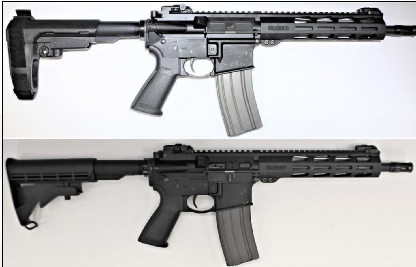
Firearm with “Stabilizing Brace” (top) Firearm with Known Commercial Stock (below)