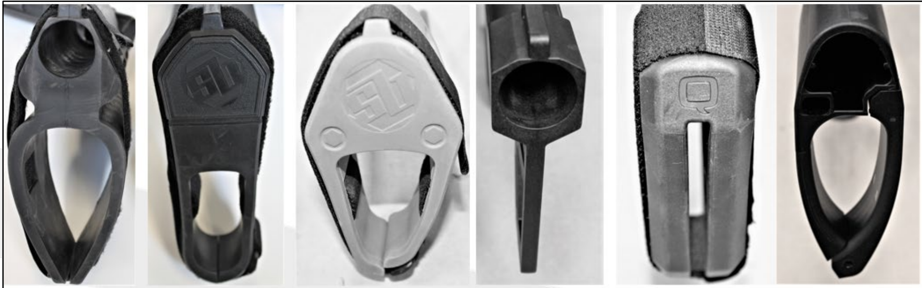
Various Designs with Sufficient Surface Area That Allow Shoulder Firing

(2) When a weapon provides surface area that allows the weapon to be fired from the shoulder, the following factors shall also be considered in determining whether the weapon is designed, made, and intended to be fired from the shoulder