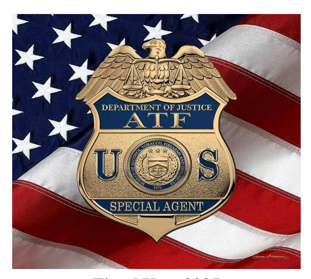
Fiscal Year 2025 Performance Budget CJ/PB Submission